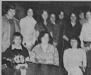
Lilac Triangle No. 121 gathered for Bowling Party at Culver Lanes.